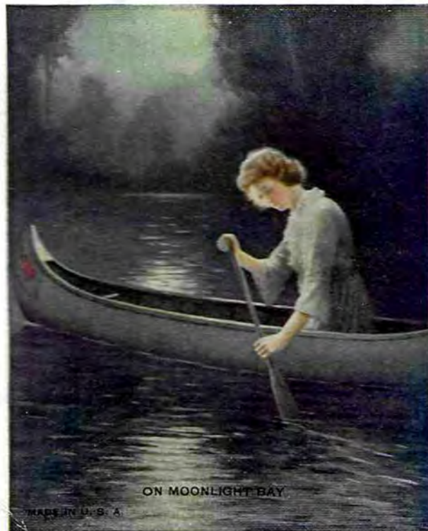
ON MOONLIGHT BAY