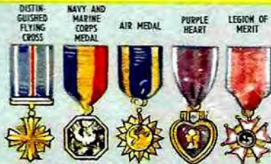
DISTINGUISHED FLYING CROSS