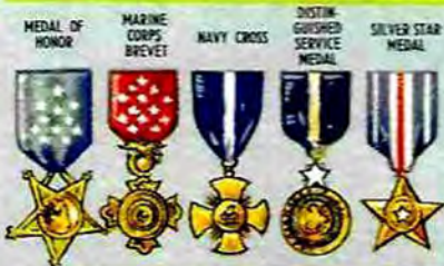
MEDAL OF HONOR